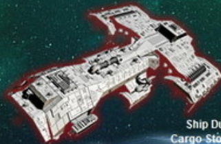
Karak VII Fighter-Class ship.

Ship Durability: 125 Cargo Storage: 200 Units Passenger Capacity: 7 Gas Tank: 40 Gallons Ship Offense: 4-12 Damage