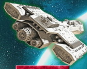
Mark V Cargo-Class ship.

Ship Durability: 175 Cargo Storage: 500 Units Passenger Capacity: 3 Gas Tank: 30 Gallons Ship Offense: 3-8 Damage