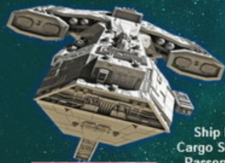
Simeon IV Stock fleet ship.

Ship Durability: 150 Cargo Storage: 300 Units Passenger Capacity: 5 Gas Tank: 45 Gallons Ship Offense: 2-6 Damage